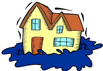
“Flooded Home -- Don’t let this happen to you”

2. SUN. What rooms in your house do you want