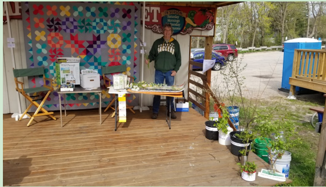
Sparta Farmers Market

Invasive of the week: Saturdays, May - October