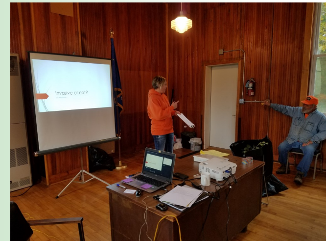
Invasive Species Training at the Town of Scott