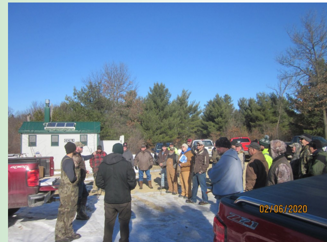
Field trip: Basal Application of Herbicide on Buckthorn