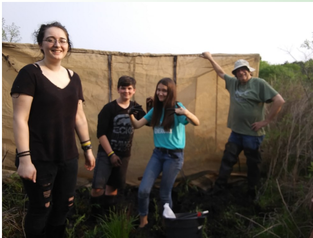
West Beaver Creek 4-H Club, at the Purple Loosestrife Beetle tent

MCISWG is now a CISMA (Cooperative Weed Management Association)