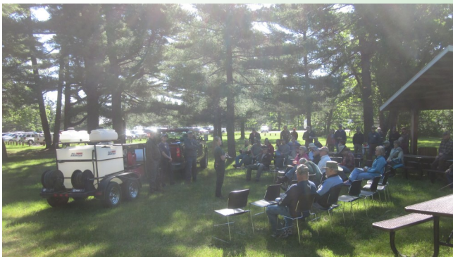
Field Day at Pine View Campground in June

The Monroe County Invasive Plants Working Group (MCIPWG) was originally established in 1998, but lapsed for a few years after 2007. MCIPWG focused on issues relating to the problem invasive species in the county: Canada thistle, spotted knapweed, garlic mustard, purple loosestrife, leafy spurge, and buckthorn. These non-native plant species pose potential economic, health, ecological, and recreational problems. Wild Parsnip was starting to show up and an educational flier was added to the leaflet library. The group attended meetings educating the public and were instrumental in biological control programs for leafy spurge, purple loosestrife and spotted knapweed. In 2017 the working group was reformed as Monroe County Invasive Species Working Group (MCISWG). A new core of landowners and agency staff meet regularly and have already notched up some successes in what can only be described as a depressing situation. One important milestone to note is the status of MCISWG as a CISMA, meaning we will be able to apply for grants to get more done. We have an enthusiastic private landowner volunteer base that are committed to finding new resources identify and treat invasive, non-native species.