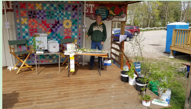
Sparta Farmers Market

Invasive of the week: Saturdays, May - October