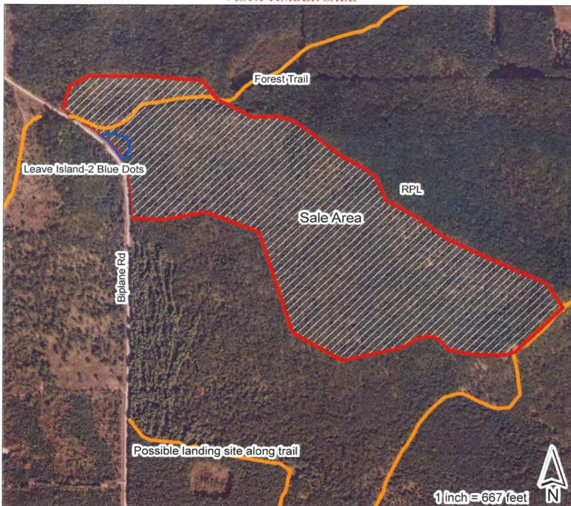
This map is not a survey of an actual boundary of any property the map depicts.

Harvest Area: 87 acres. W is bounded by Biplane Road, rest of sale is bounded in RPL. Forest trails enter sale from Camp Avenue at south and at the north off Biplane Road. Do not cut any boundary trees marked with paint.