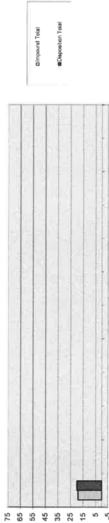
Impoundments and Dispositions