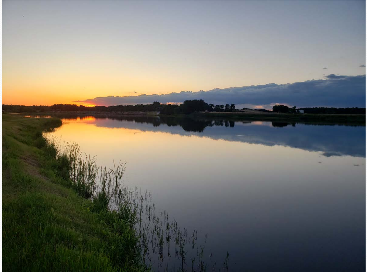
Bogs at Sunset