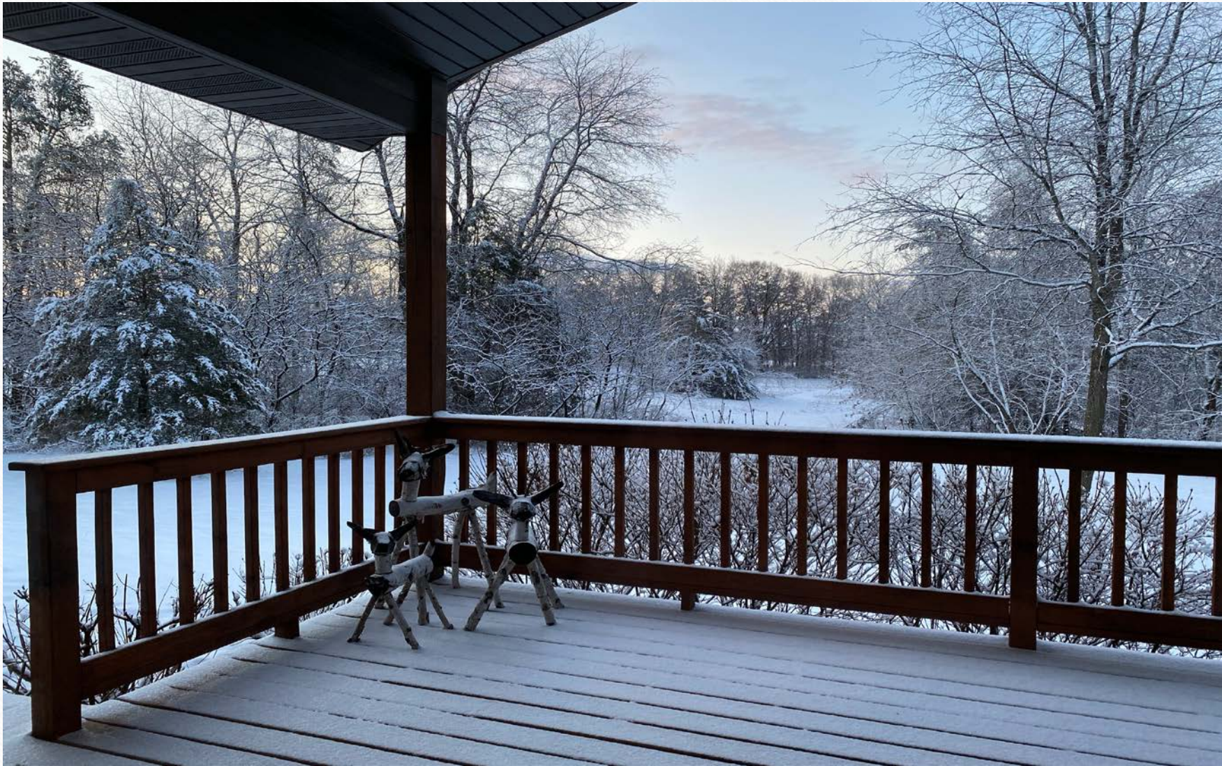
Winter in April