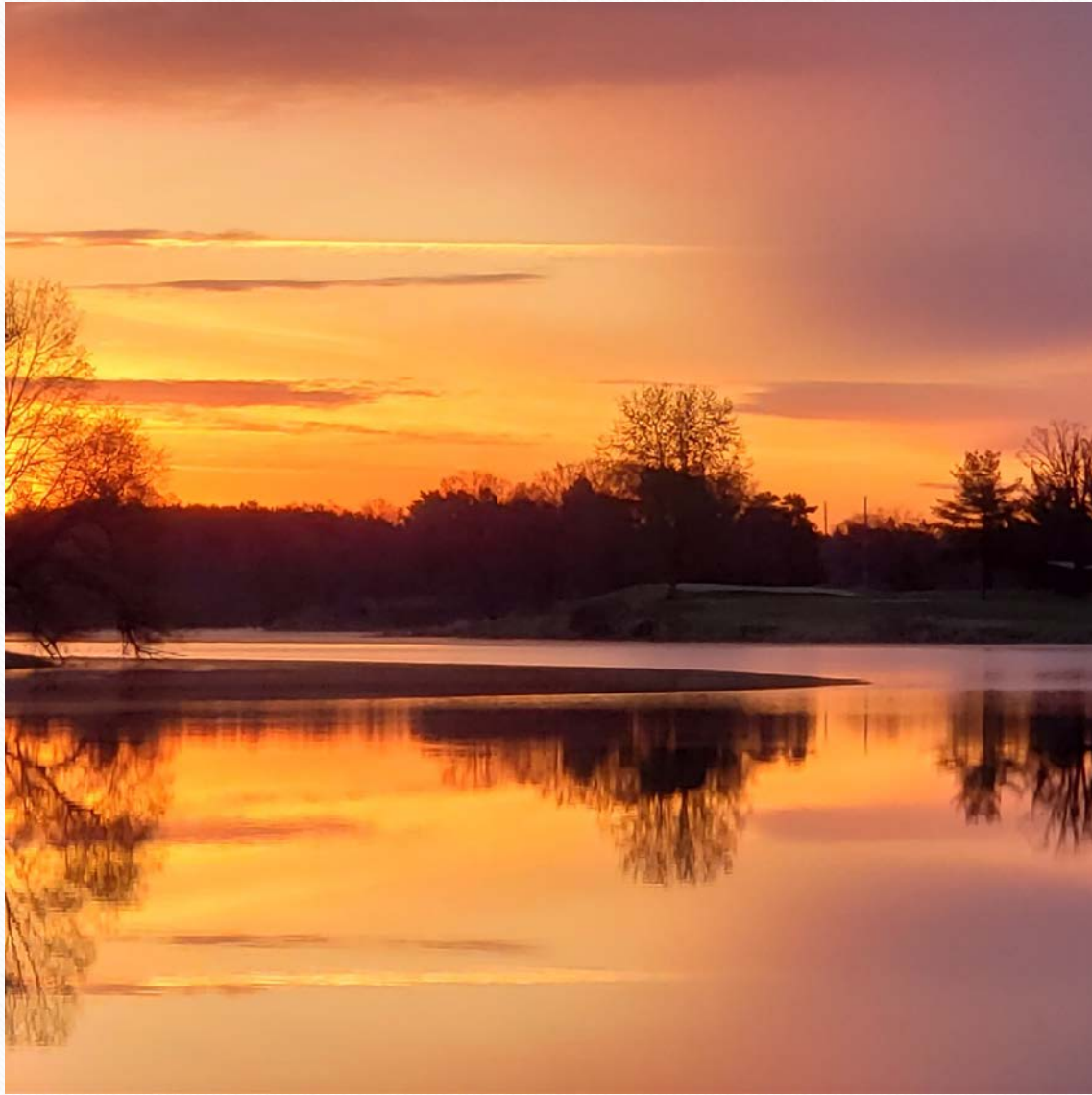
Sunrise Perch Lake