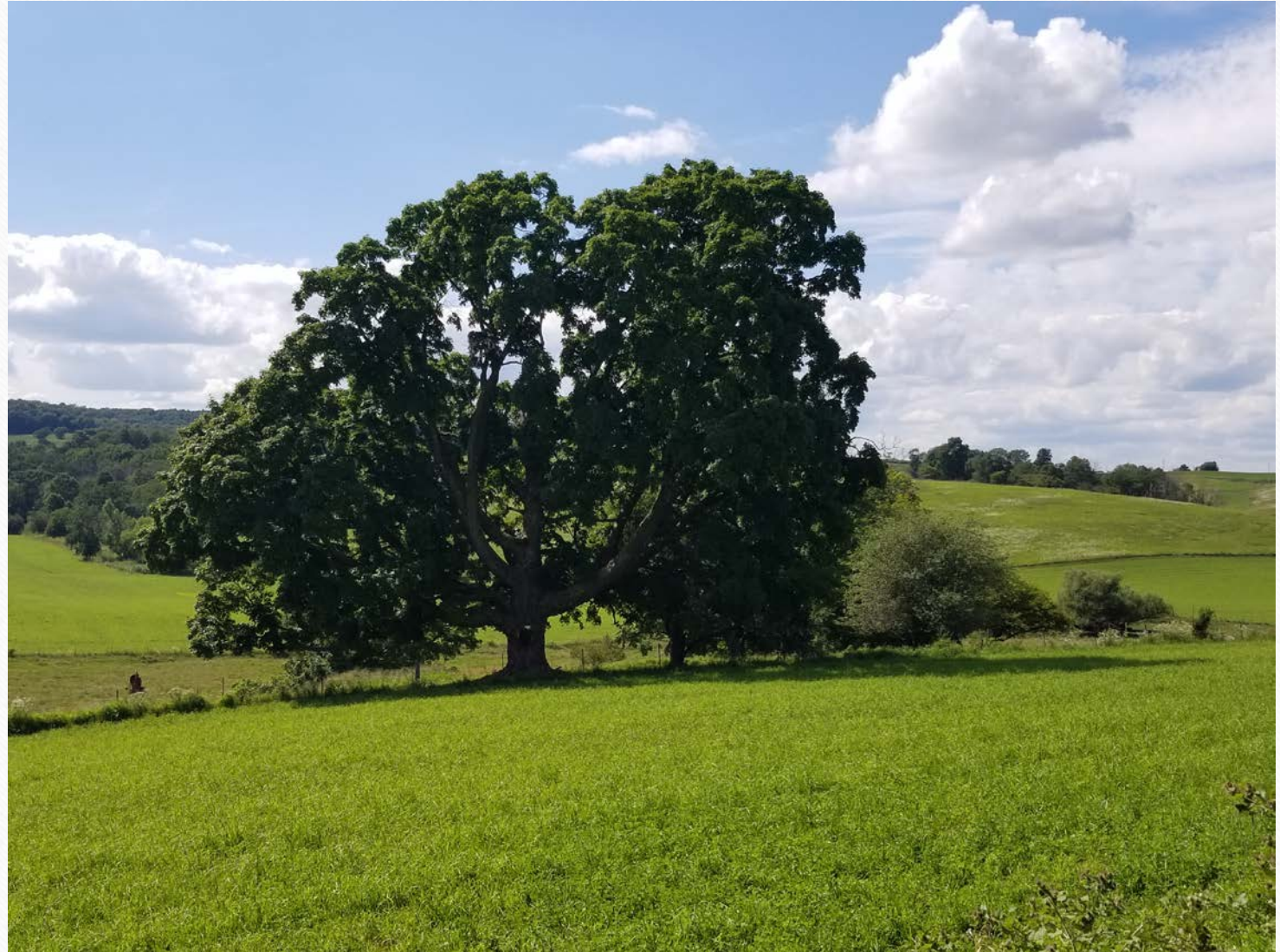
The Old Oak