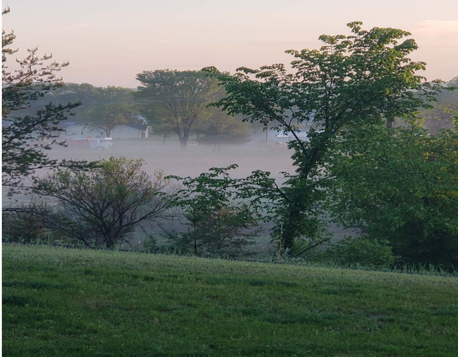
Fog in Early Morning